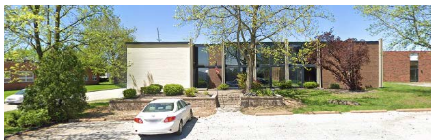
Google Street View